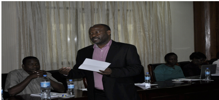
TOAM's CEO providing explanation at plenary discussion